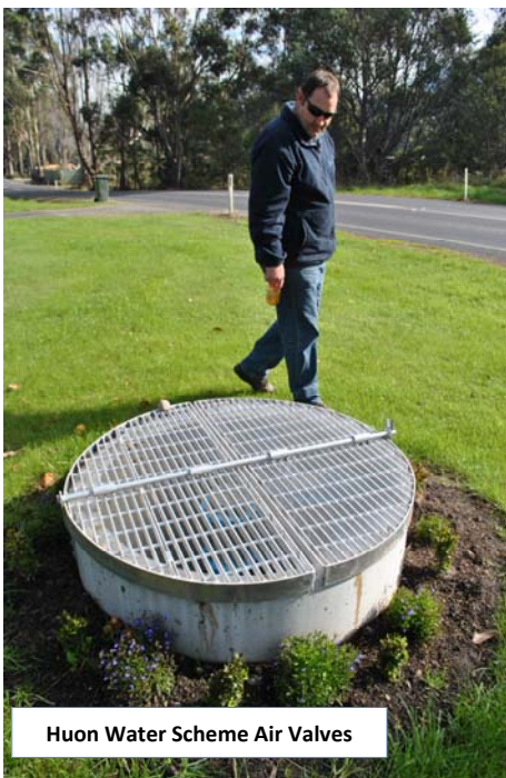
Huon Water Scheme Air Valves