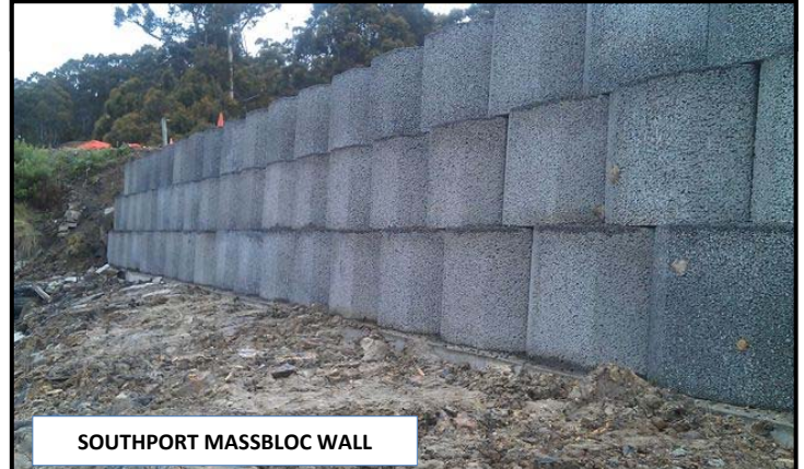
SOUTHPORT MASSBLOC WALL